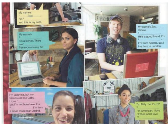
Figure 4. Greeting people and making introductions (from Language Hub A2. Elementary. Student’s book by P. Maggs, C. Smith, A. Tennant, Macmillan Education, 2019)

In addition, according to the IITU General English course’s Syllabus Elementary students should be able to describe the appearance and personality of the members of their family. If students want to learn words about the family members and describe the personality and appearance of them, they can work with the following activities: