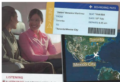
Figure 1. Talking about countries and nationalities

First of all, we would like to point out that we can use different effective activities in order to improve students’ vocabulary. For instance, Language Hub Elementary level course book (2019) offers different useful activities for speaking about countries and nationalities (Fig. 1):