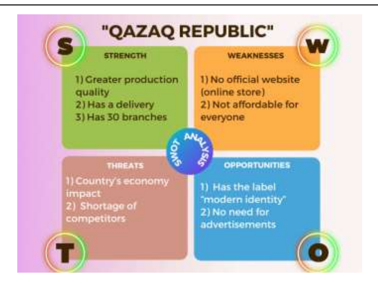
Figure 1. Diagram of the SWOT matrix (complied by the authors)

There are advantages of the SWOT matrix as a method of strategic analysis: