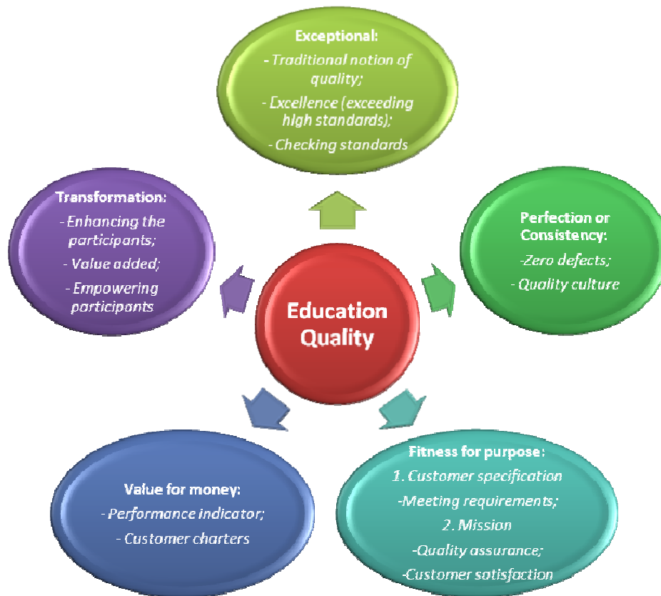
Figure 3. Quality framework by Harvey and Green (1993)

Harvey and Green [11] provide a useful framework by analysing quality into five different but inter-connected categories, namely: exception, linked to the idea of 'excellence'; perfection or consistency, which focuses on process and the set specifications it aims to meet; fitness for purpose, which judges quality in terms of meeting stated purpose; value for money, which assesses quality in terms of return on investment or expenditure; and transformative, indicates a process of fundamental change (for full model see Fig. 3).