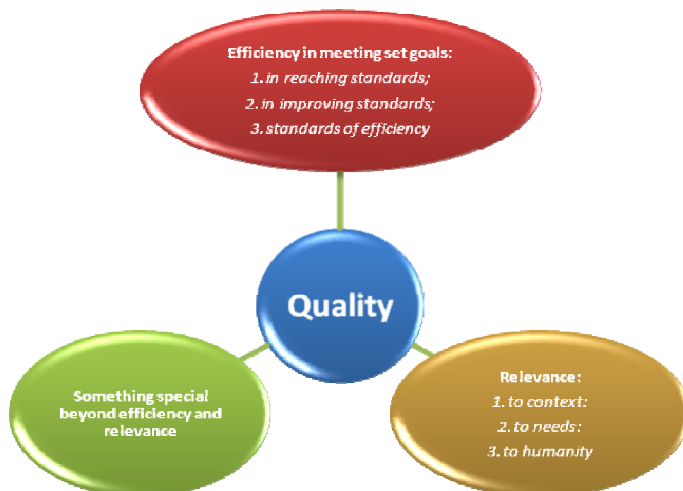
Figure 2. Quality framework by Hawes and Stephens (1990)

An approach to differentiating quality was given by Hawes and Stephens [8], where quality can imply 'efficiency in meeting set goals', 'relevance to human and environmental needs and conditions', and 'something more', in relation to the pursuit of excellence and human betterment (ibid: 11) (for full models see Fig. 2). Although, the approach is built on defining quality in primary education, it could be claimed that the approach also has relevance to HE and could be applied in the analysis of the current study.